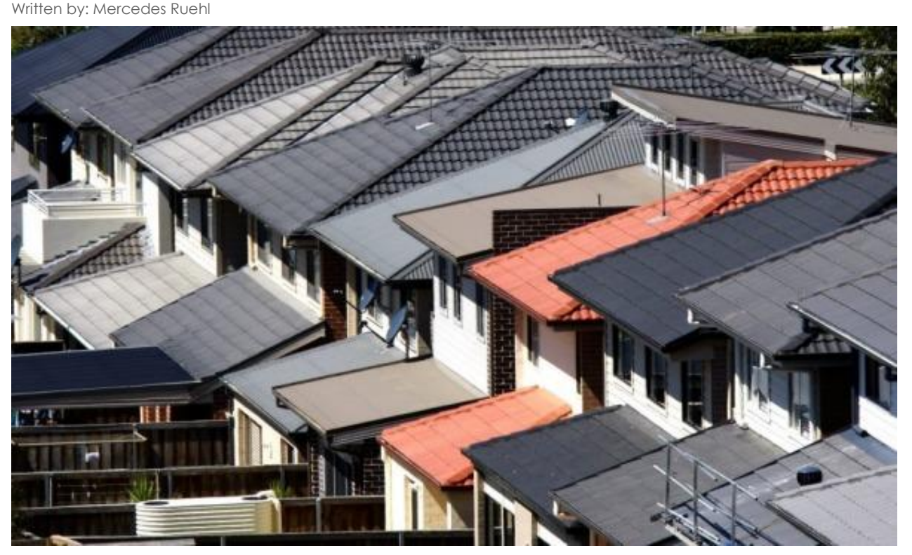
While still\ a\ newish\ suburb,\ Pemulway\ has\ been\ one\ of\ Sydney's\ top\ suburbs\ for\ housing\ price\ growth\ thanks\ to\ development\ according\ to\ Domain\ Group\ data.

Property group Mintus in partnership with Revelop has swooped on the last remaining parcel of land at Nelsons Ridge in Sydney's west, acquiring the prime site from building products heavyweight Boral for just under $60 million.